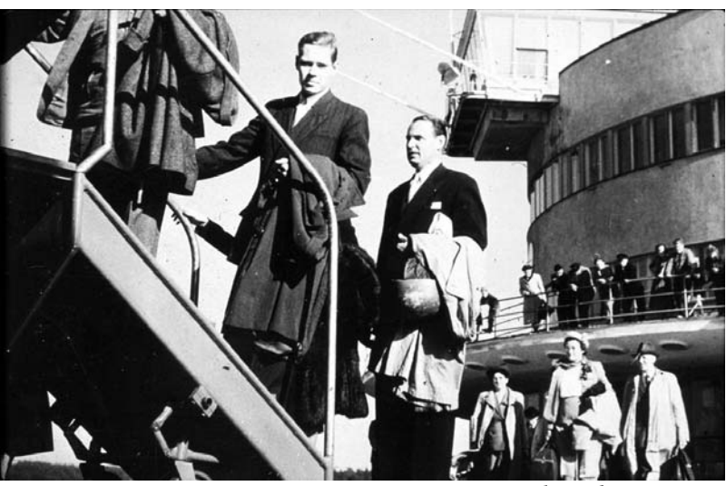
Passengers at Malmi.

By the late 1940's it had become obvious that the soft clay soil of Malmi Airport could not