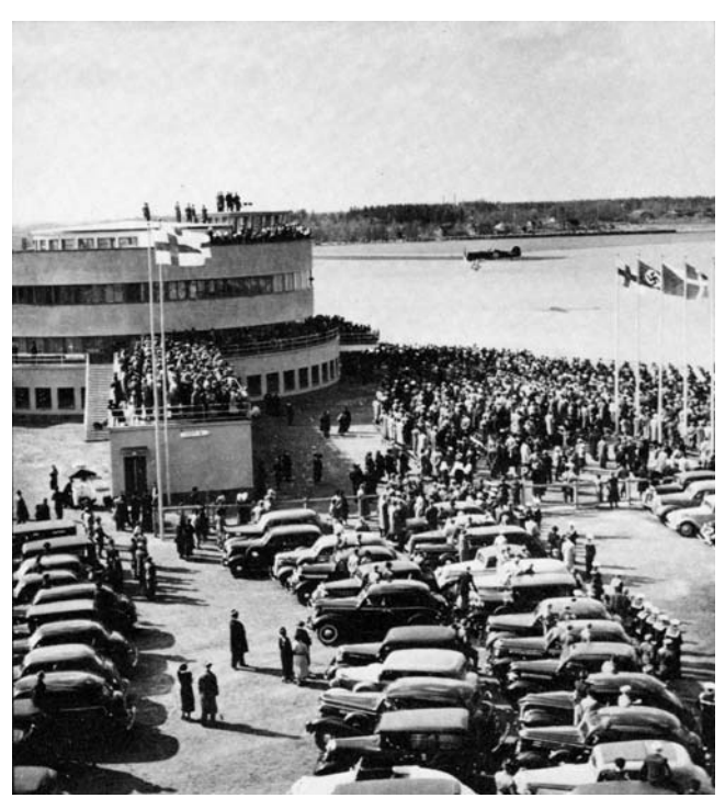
The opening of Helsinki Airport at Malmi, 15 May 1938.

Malmi Airport was the first airfield in Finland to be designed from scratch, buildings and all, as an international passenger Its 2.400-ft concrete-paved runairport. ways, built on difficult ground, as well as the instrument approach systems and other equipment represented the most modern way of airport-building in those days. Traffic began in December 1936, when only the runways had been completed, to save the capital from being left out of the route network as all passenger aircraft were quickly converted from floats to wheels for operation from the land airports in Turku and Stockholm. At that time the terminal and the hangar were still under construction.