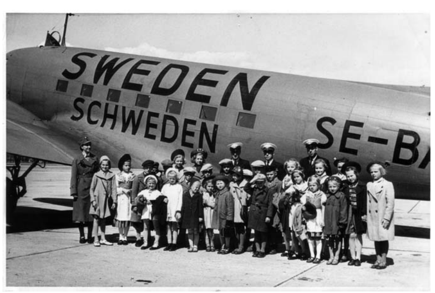
Children at Malmi Airport on their way to safety in Sweden in May 1942.

During the Interim Peace (from March 1940 to June 1941), however, the passenger aircraft returned to the capital. The state of peace was charged and tense. In June 1940 the Soviet Union occupied Estonia, Latvia and Lithuania. and Aero's Junkers Ju-52 "Kaleva" was shot down on a regular flight from Tallinn to Helsinki. Nevertheless, the route network kept on ex-