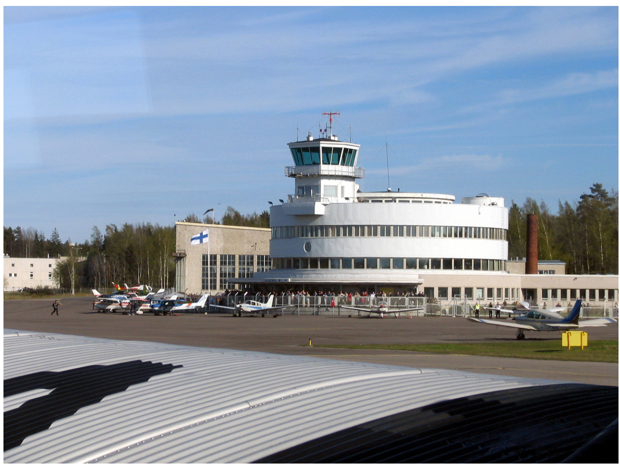
Malmi Airport on its 67th Anniversary, 15 May 2005.

As a still active integral piece of aviation building heritage, Malmi Airport is a world-class rarity. The international esteem it enjoys is reflected in the selection of the Airport to the global List of 100 Most Endangered Sites by the World Monuments Fund in 2004-2005 and in 2006-2007.