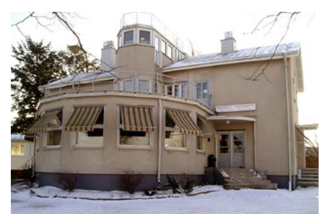
The terminal of Artukainen Field today. The control tower is occupied by the hotel sauna.

flights in 1953 and faded away after the new airport in Oulunsalo was completed. The old Laajalahti Field in Kokkola was closed down in the late 1950's. Regular traffic moved from Turku's Artukainen Field to the new Rusko airport in 1955 and other air traffic ceased ten years later. Härmälä Field in Tampere served passenger and military traffic until 1979 when the new airport in Pirkkala was completed.