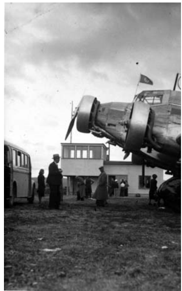
Terminus of "Lapland Express", Yläluostari Field in 1940.

While building new airports, several old airfields have been completely closed down and their lands ceded to other purposes. Oritkari Field in Oulu, opened in 1936, was abandoned by regular