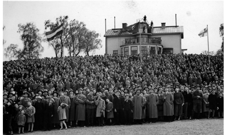
The opening ceremony of Artukainen Field in Turku on 8 September 1935.

The first-generation passenger airports in Finland were mostly austere and simple, and their modest wooden terminals and hangars did not aim for architectural merit. The international airports, Artukainen in Turku and Malmi in Helsinki, were an exception.